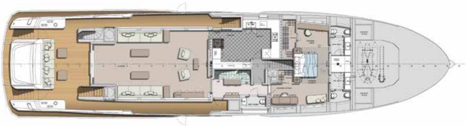
Main Deck version B